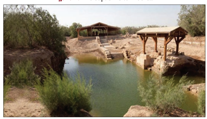
Figure 1: The baptism site in Jordan