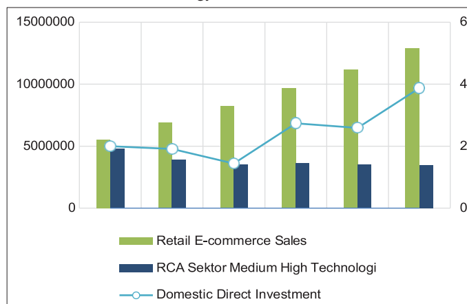
Figure 3: Trends in retail e-commerce sales, domestic direct investment, and revealed comparative advantage of medium high technology sector in Indonesia

2021, with a slight increase to 1.395 in 2022. This downward trend reflects the ongoing challenges faced by the medium-high technology sector in maintaining comparative competitiveness amid global market dynamics (Wijaya and Saputra, 2021). Overall, these findings indicate that while DDI contributes significantly to strengthening the sector’s capabilities, an increase in Retail E-commerce Sales may exert competitive pressures that hamper the competitiveness of the medium-high technology industry in Indonesia (Rahman and Santoso, 2022).