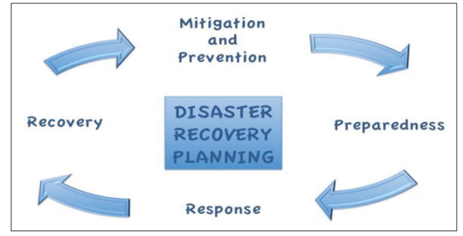
Figure 2: Disaster recovery planning cycle

Disaster management planning which emphasizes disaster prevention, mitigation, preparedness, and vulnerability reduction is integrated into the administrative levels of government. BNBP furnished all provinces with disaster management plans in 2012-