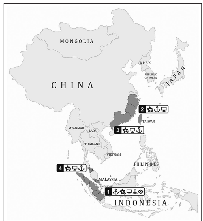
(1) Singapore – Malaysia – Indonesia; (2) The Taiwan – Suzhou Large; (3) Guangdong – Fujian – Hong Kong – Taiwan; (4) Indonesia – Malaysia – Thailand; the map is created with the informational background.

Figure 3: Trans-aquatorial cluster Singapore – Malaysia – Indonesia