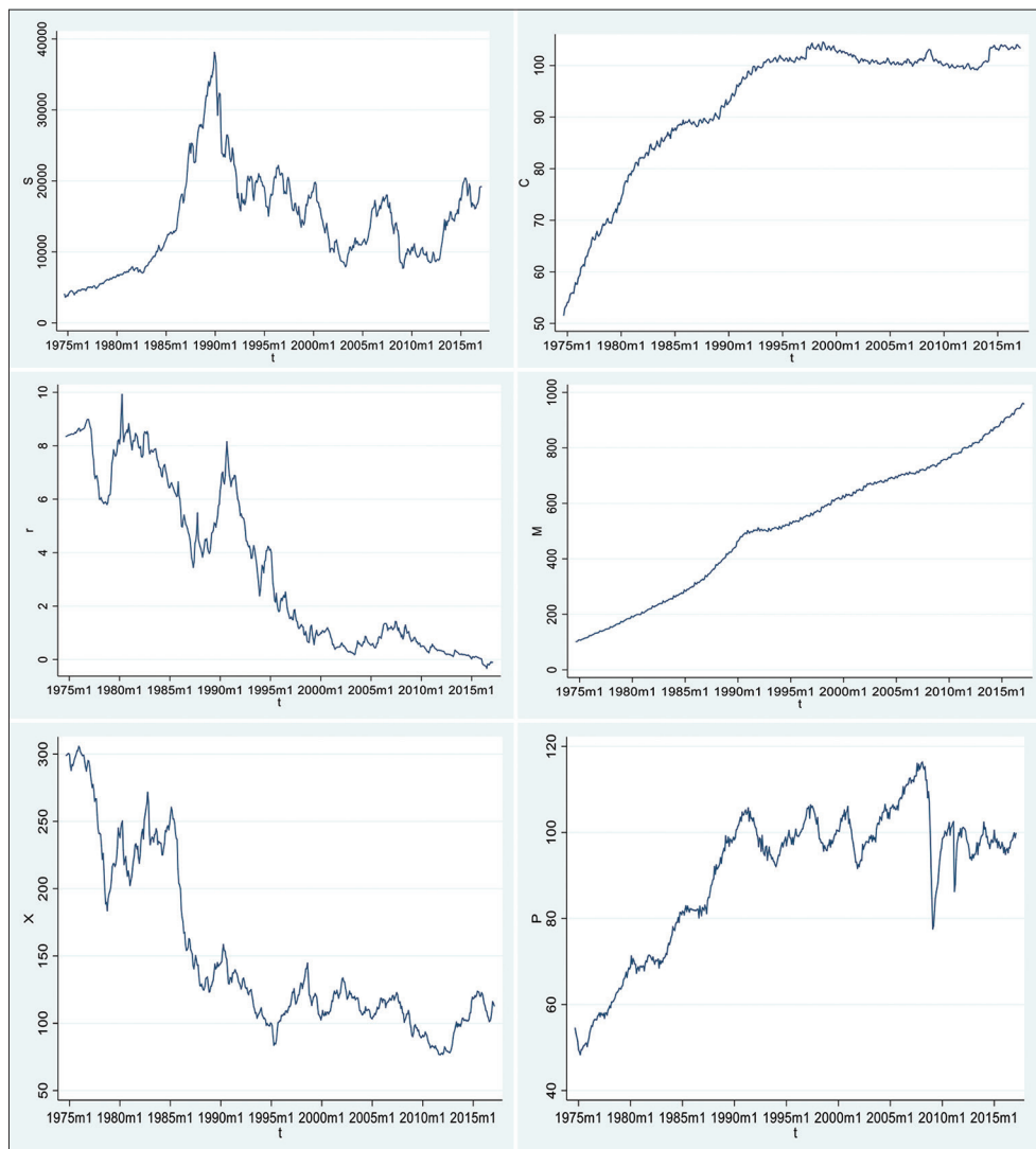
Appendix A: Timeline plot of variables (1974-2017)