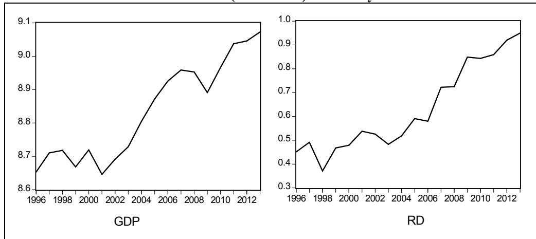
Figure 1. Real GDP per capita (Natural Logarithm) and RD expenditure (% of GDP) in Turkey

Statistical Institute (Turk Stat). The annual data are selected to cover the period from 1998 to 2013. We see that increased GDP and R&D outside a few breaks which occur after crisis (see Figure 1).