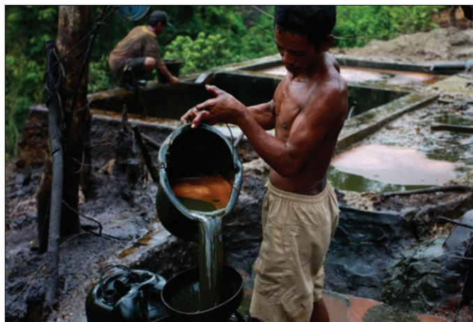
Figure 1: Crude oil from marginal wells in Indonesia

utilizes Lagrange multiplier (LM) test, homoscedastic test utilizes ARCH test, and normality test utilizes Jarque Berra test.