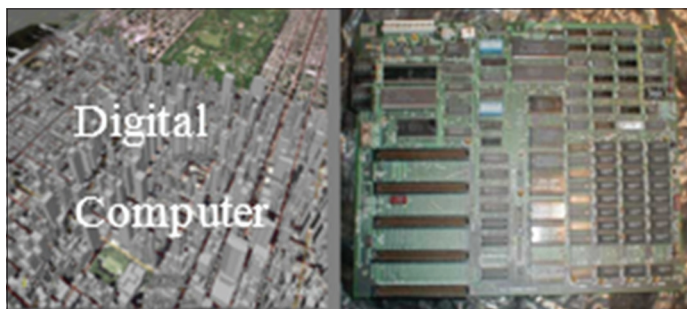
Figure 1: The area substrate as a computer motherboard

transformed to be the feedback. Wc – complete consumer's informativity regarding its water consumption, bonds and money where consumer's water meter. Wm is the controlled informative source; the feed forward. Wb represents electronic water munis market, the comparative feedback mechanism. BK represents the legally shared online bonds bookkeeping database.