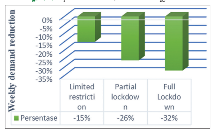
Figure 1: Impact of COVID-19 on world energy demand

While some studies have explored the effect of oil taxes on inventory markets in rich (Hammoudeh and Aleisa, 2004); (Basher and Sadorsky, 2006), others have researched them in developing countries (Abraham, 2016); (Chang et al., 2013); (Degiannakis et al., 2017); (Baimaganbetov et al., 2021); (Wang et al., 2021).