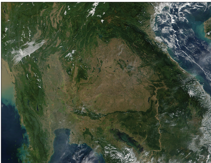
Figure 1: Thailand boarder for Cambodia and Laos

boarder with the Cambodia and Laos as observed through brown color, showing the deforestation in the country.