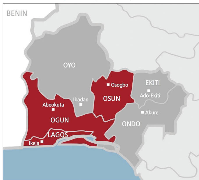
Figure 1: Map of the study area