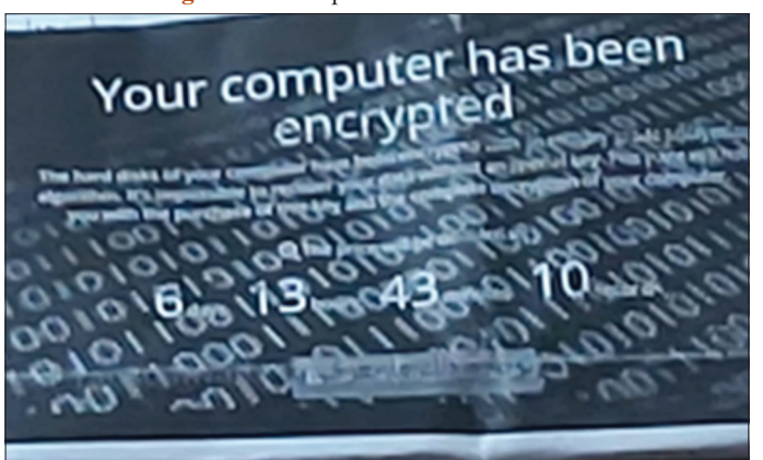
Figure 1: A sample of ransomware attack

There has been less previous evidence for discussing how can the third part play his role and save keeping the decentralized and the privacy of cryptocurrency at the same time moreover, few studies have focused on implementing tokens in order to save the currencies in the wallets.