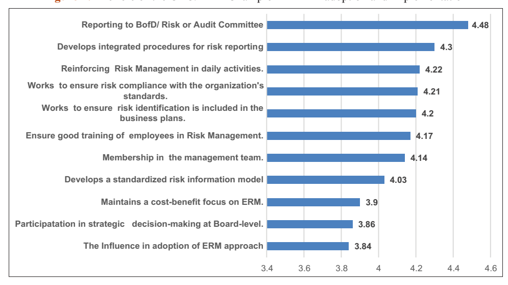
Figure 2: The role of the CRO/ERM Champion in ERM adoption and implementation