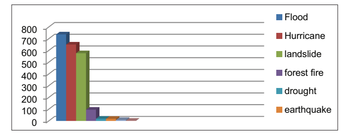
Figure 2: Ecological disaster emergency status data in Indonesia