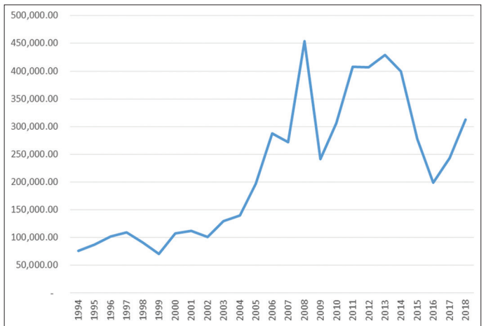
Figure 1: Gas export from Russia, mln. USD

In offshore projects exploration and production (E&P) is conducted by foreign energy companies and national/regional government or a state energy company.